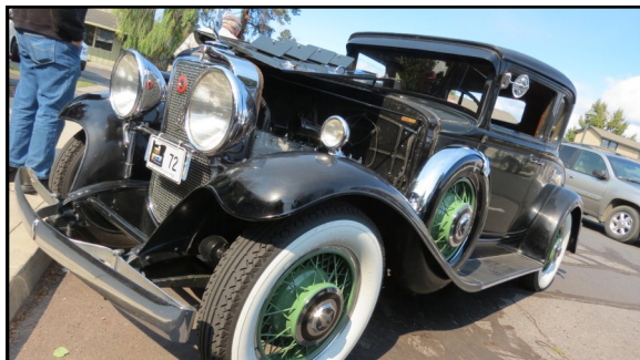
Clockwise, from top left: 1937 Packard; two 1941 Cadillacs; 1931 Peerless