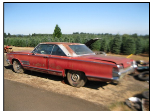
You can own this 1966 Chrysler 300!

Donations of cars and or related memorabilia to fund operations or the building fund are always welcome. Remember, these donations are eligible for tax deductions as we are a 501(c)(3) non-profit educational organization.