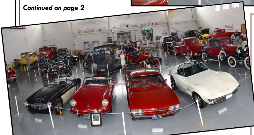
Start your engines! These sports cars are ready to race!