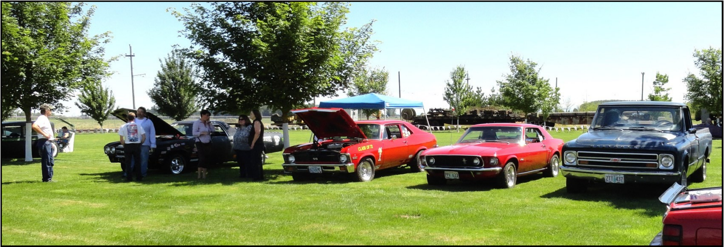
Visitors take advantage of the shade and good conversation at the All-Club Rendezvous.