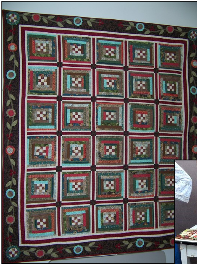
Above: This year's quilt for raffle—get your tickets before Steam-Up is over!