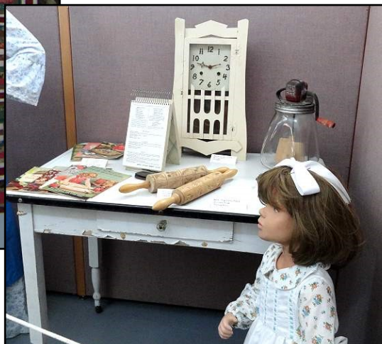
Right: Part of the vintage housewares on display this summer in the Ladies' Corner.

T his year the Ladies' Corner is displaying kitchen and houseware items. I'm sure that when you visit you will recognize many of the things that you, your mother, or grandmother used around the house, or maybe, some things that you've never seen before. We send a big thank you to all of you who loaned items for this display. Without your generosity we would not be able to fill our area with unique and memorable things.