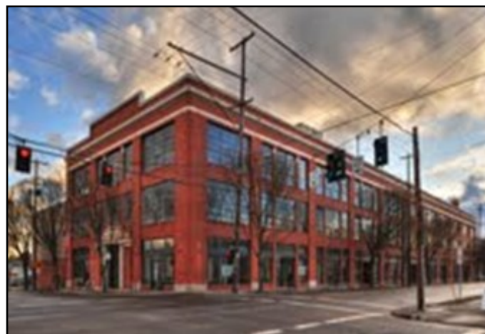
Top: An original assembly line ramp