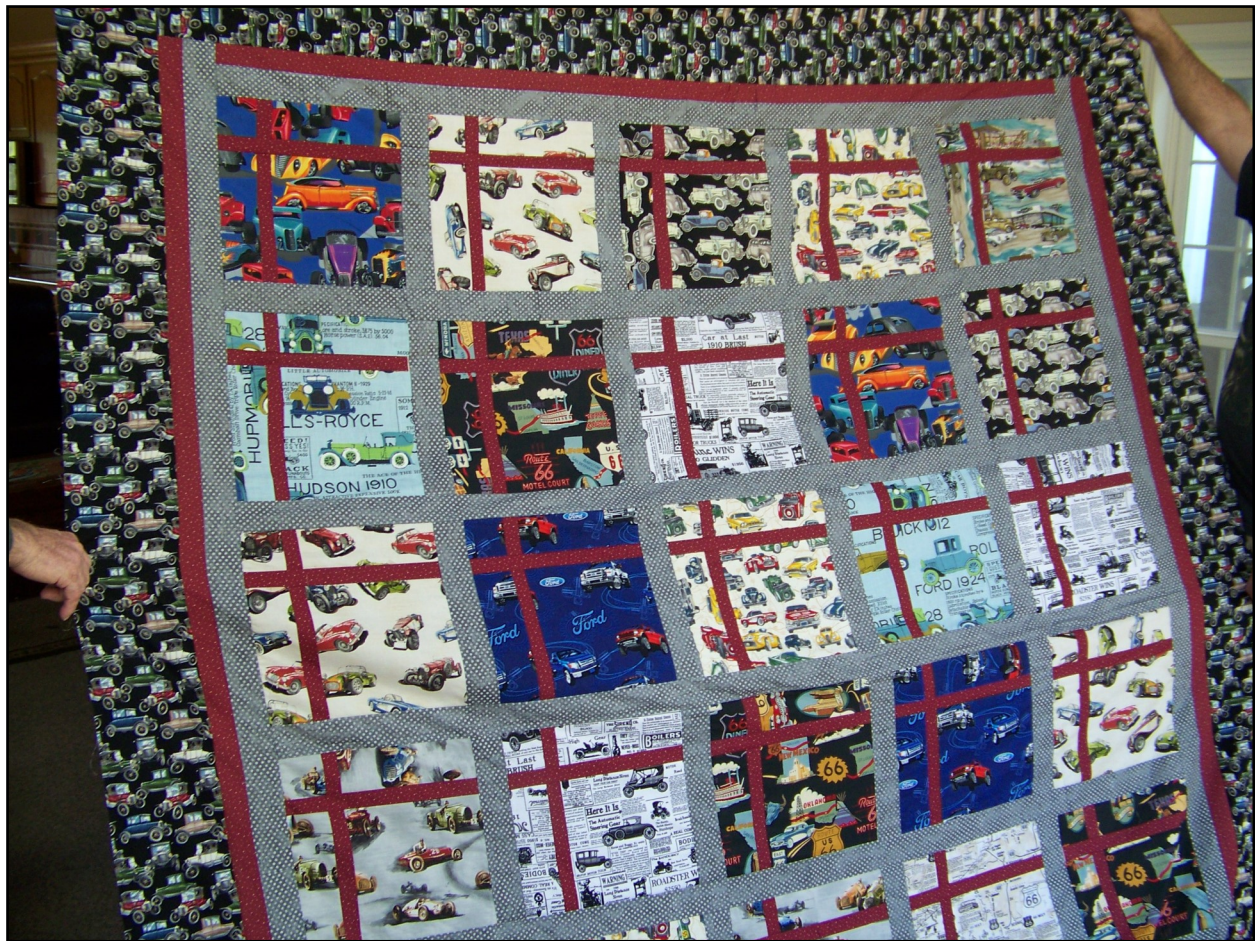
This year's car-themed quilt. Buy a raffle ticket. It's even more impressive in person.

The Ladies group does not meet regularly each month but gets together as needed to work on the quilt and set up displays. If you are interested in attending a meeting or helping in any way please contact Joanne Blain at 503-585-8078 or email djblain@msn.com .