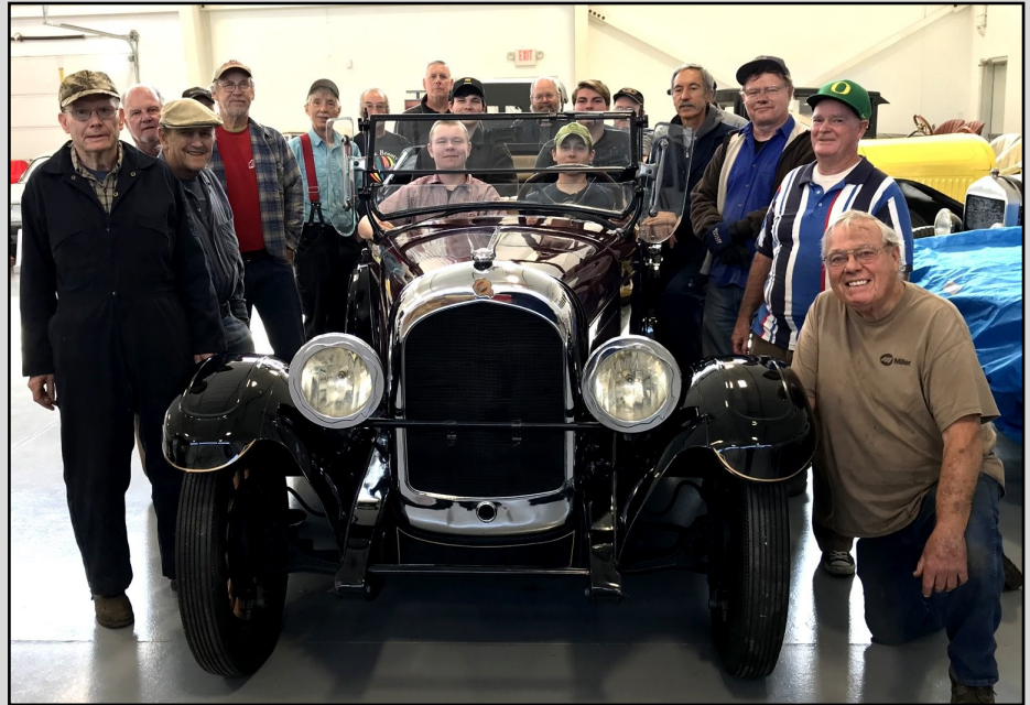
Mentors and students pose for a photo in October 2017.

We are still working on the 1926 Model T Roadster Pickup for the museum. We have received several nice donations for which we want to thank those who contributed them to the program.