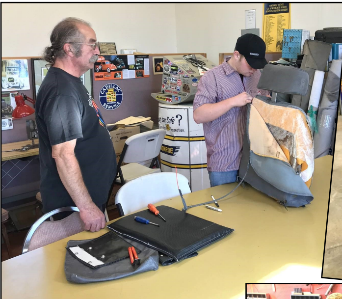
Upholstery class: This isn't your mother's sewing needle!