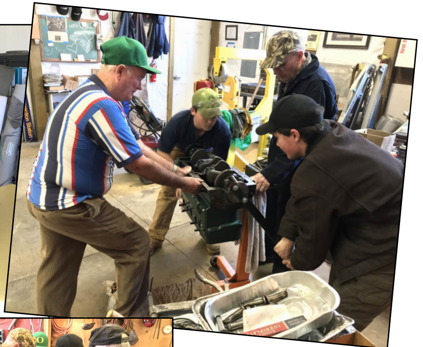
Above and right: students get up close and personal with the engine.