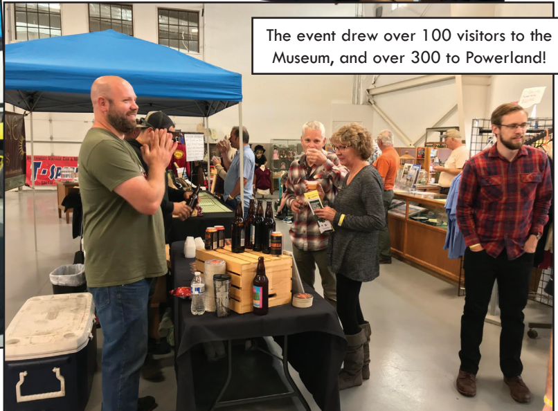
The event drew over 100 visitors to the Museum, and over 300 to Powerland!