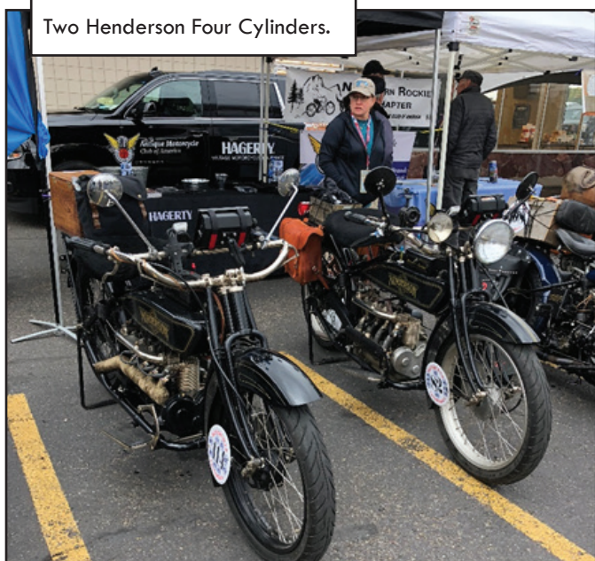
Two Henderson Four Cylinders.

While this was a competitive event and everyone wanted to win, I found a real sense of camaraderie and family amongst the riders and crews. They helped each other with advice, parts, and labor to try to keep everyone going the next day. Everyone I talked to had that attitude and it was a genuine sense of concern for the well-being for the other riders. It was an amazing event!