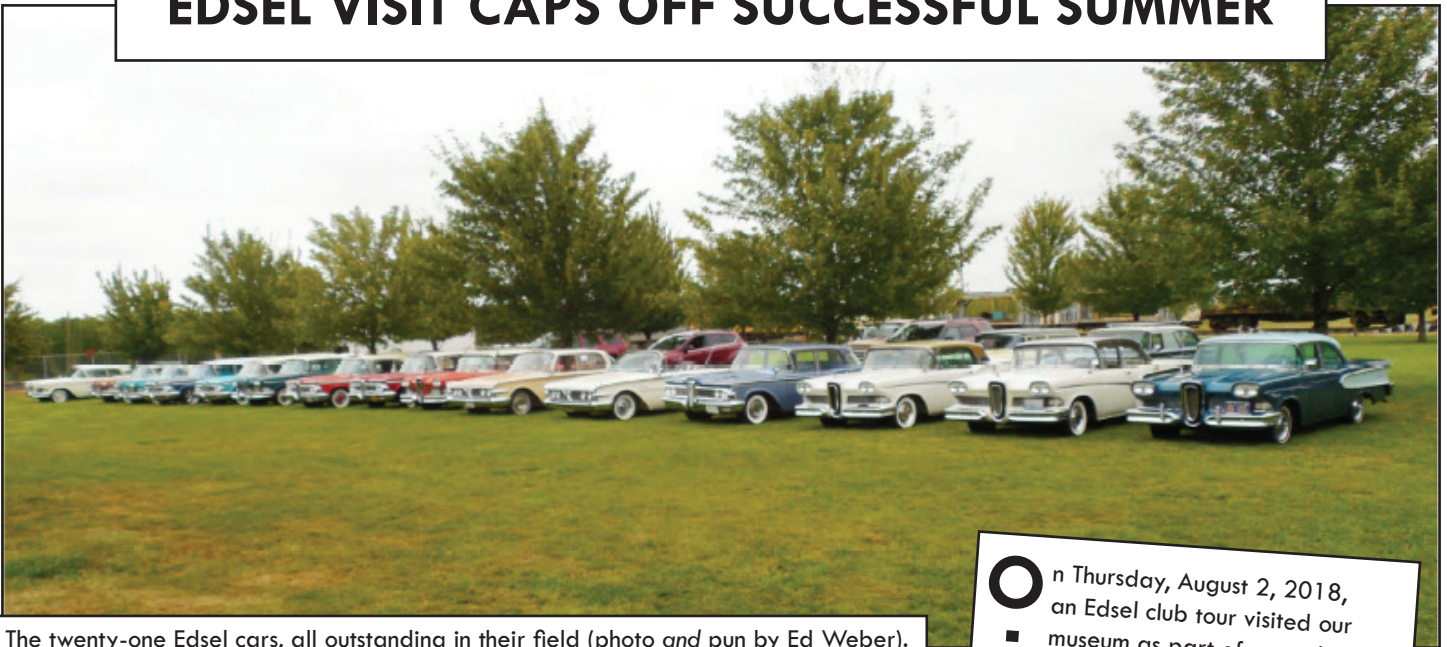
The twenty-one Edsel cars, all outstanding in their field.