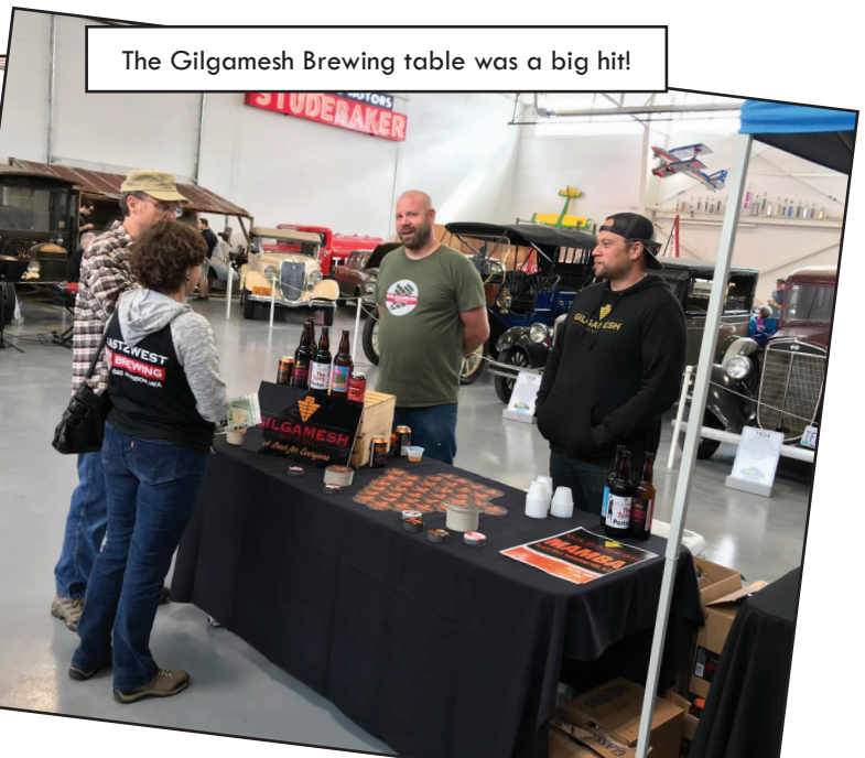
The Gilgamesh Brewing table was a big hit!