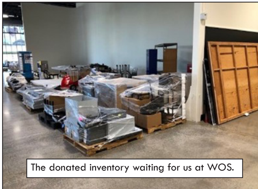
The donated inventory waiting for us at WOS.

In collaboration with our board of directors and a few other key individuals, we came up with a long wish list of things we would like to have. Since one of the stated selection priorities by WOS was to keep as much of their assets within the Northwest Region, we felt