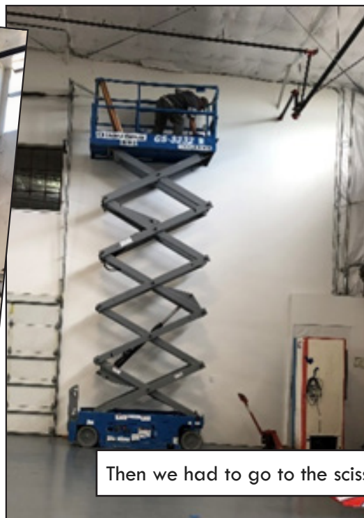
Then we had to go to the scissors lift.