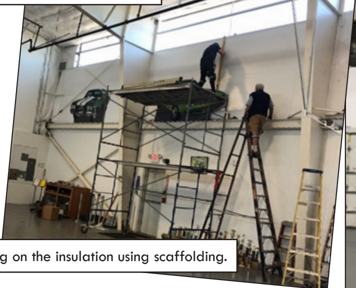
Working on the insulation using scaffolding.