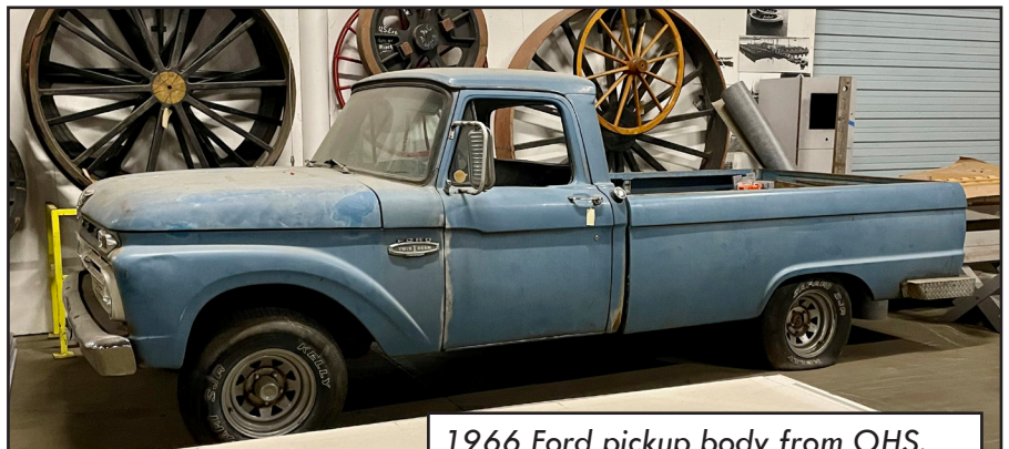
1966 Ford pickup body from OHS.