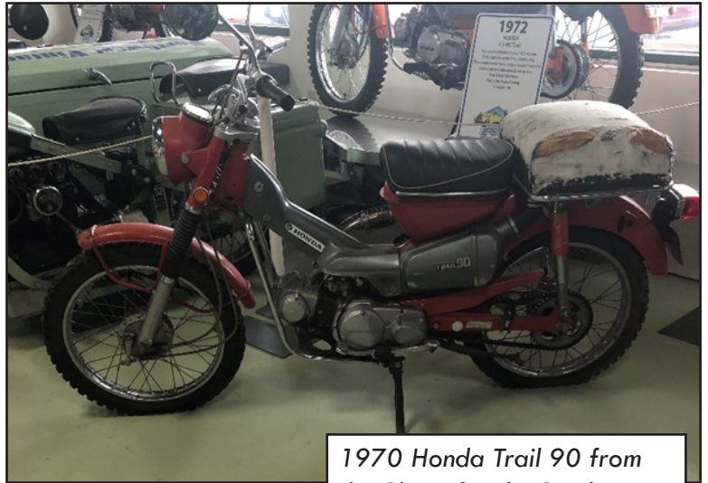
1970 Honda Trail 90 from the Chase family, Gresham.