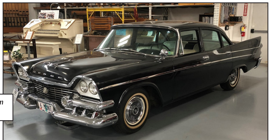
1958 Dodge Coronet from OHS. Fabulous 50's!