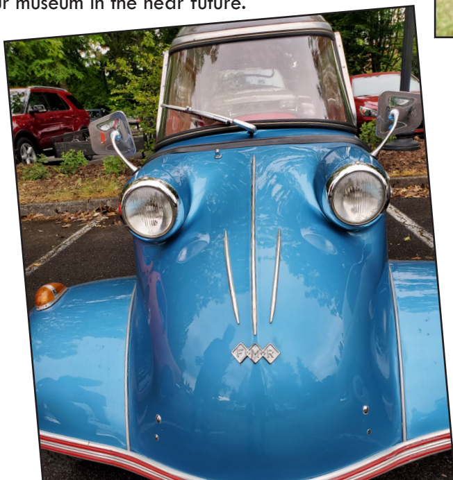
This little FMR was a sports car built by Fahrzeug- und Maschinenbau GmbH, Regensburg (FMR) from 1958 to 1961.

In 1955, the BMW Isetta became the world's first mass-production car to achieve a fuel consumption of 78 mpg.