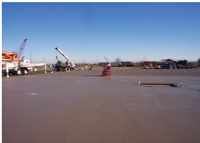
New Museum Flooring

Museum members are encouraged to contact Doug Nelson with ideas for raising these funds. Working together we will build the only member-owned car and motorcycle museum in the Northwest.