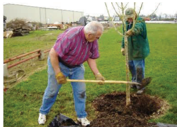
THANKS to the volunteers who helped with the tree planting project.