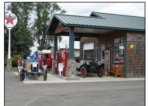
2007 Oregon Steam-Up Car Show