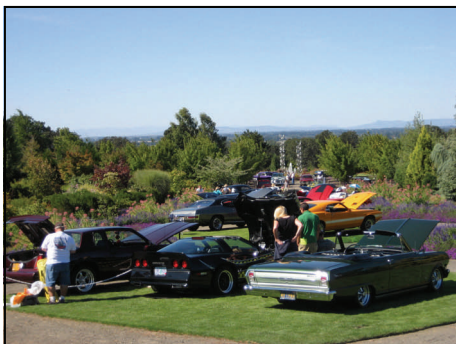
2007 Oregon Garden Car Show

Bjorn cancelled the October tour to Silver Falls as he needed commitment from more members to reserve the overnight space.