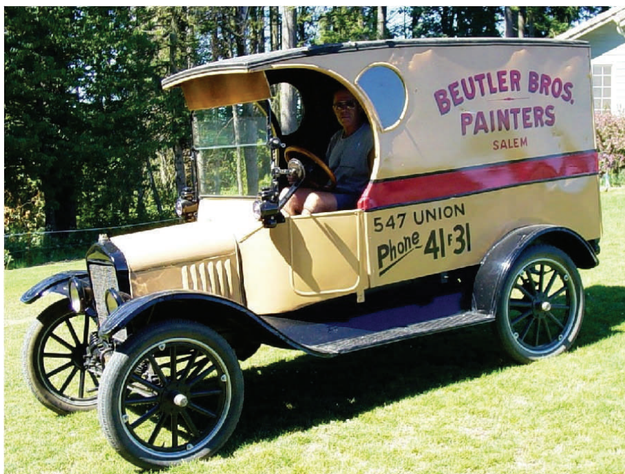
Beutler Brothers Paint Wagon