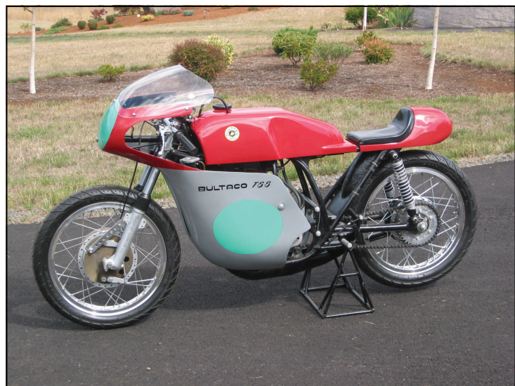
Bultaco TSS Gran Prix Road Racing Motorcycle

And the Bultaco really performs too. Every February the factory would shut down all motorcycle production and concentrate on building only road racing bikes. They only built bikes if they had pre-paid orders for them. "They were truly amazing racers. They were so fast that they were banned in the US." They were one of the first 2 stroke bikes to be water-cooled. "Water cooling was pretty much an exclusive feature of the Factory "Works" racers. This Bultaco could be bought by Joe Public and raced against the factory machines." They had a 1,2,3 victory in the Ulster GP against the more exotic Works machines from Honda and Yamaha. "The little Bultaco did well in that event considering it's only a single cylinder 250 against Honda's mighty 6 cylinder, 24 valve twincam and Yamaha's 4 cylinder rotary valve water cooled 250." Not bad for a company that builds their bikes in old barns at the end of a dirt road!