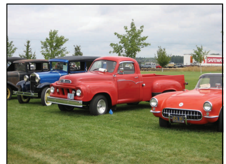
Cars & Trucks on the Show Field during the 2007 Oregon Steam-Up

Pass this newsletter on to another person and view it in color at nwcarandcycle.org .