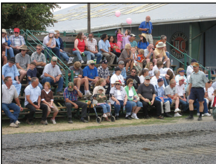
2007 Oregon Steam-Up Crowd

The Northwest Vintage Car & Motorcycle Museum is a 501c(3) non-profit organization. We are dedicated to providing educational opportunities for vintage cars, trucks, and motorcycles.