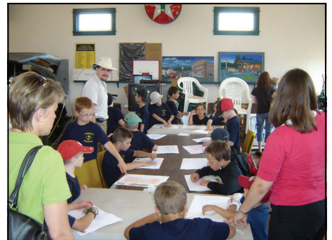
Boy Scouts doing license rubbings