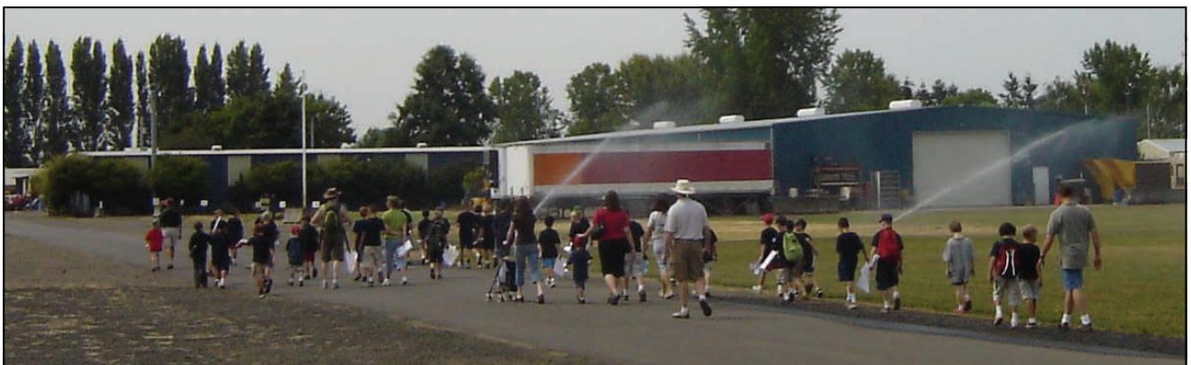
Boy Scouts Discover Antique Powerland