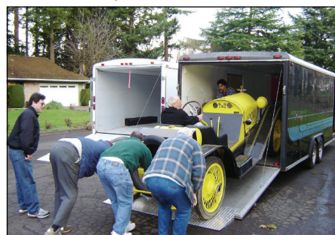
Loading the 1917 Stutz Speedster

By day's end the speedster was safely resting at the Texaco Station, waiting inspection by museum members.