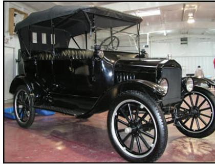
1920 Model T Ford

This museum is located on the car lot of Swopes Fords at 1100 North Dixie Avenue in Elizabethtown, Kentucky.