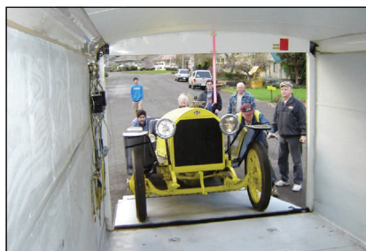
Into the trailer