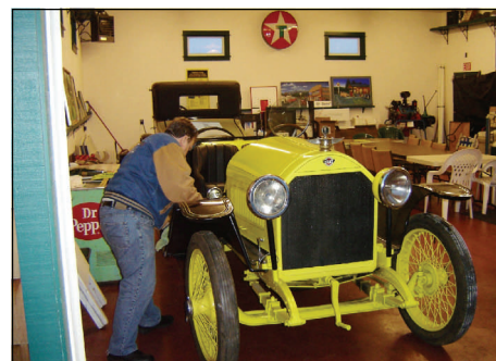
Cleaning up the Stutz Speedster