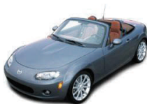
Miata Car Club