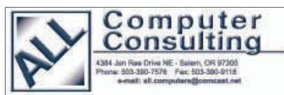
ALL Computer Consulting