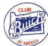
Portland Buick Club