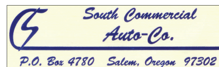
South Commercial Auto Company