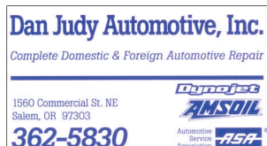
Dan Judy Automotive