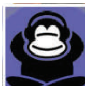
Hear No Evil Hi-Fi