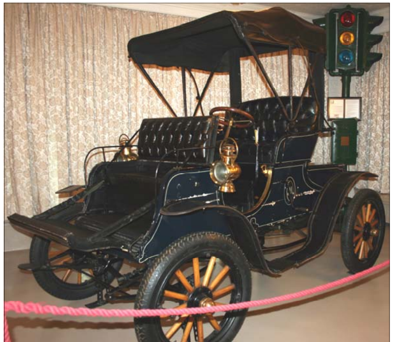
1903 Haynes-Apperson Surrey, 12hp cost $1,500