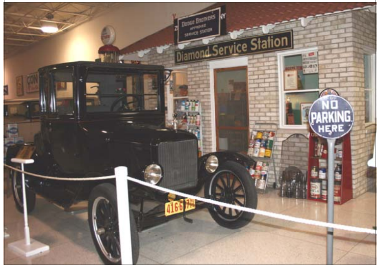
1925 Dodge in front of the replica Diamond Service Station

The museum's historic facades feature a 1930's gas station, the Haynes home, and a 1950's diner. Auto industry related displays and over 100 antique and classic cars are also featured.