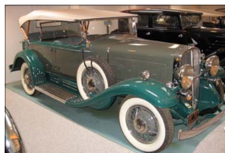
1932 V-12 Sport Phaeton

And, wouldn't you know - the curator who escorted us on our tour is one of the founders of the Tucson Corvair Car Club. That air-cooled automobile has a story all its own.