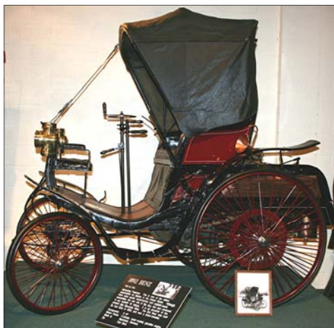
1892 Benz Car

Luray Caverns 970 U.S. Hwy. 211 West, PO Box 748, Luray, VA 22835. (540) 743-6551